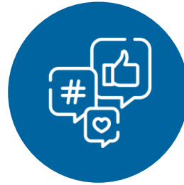
Social Media Promotion